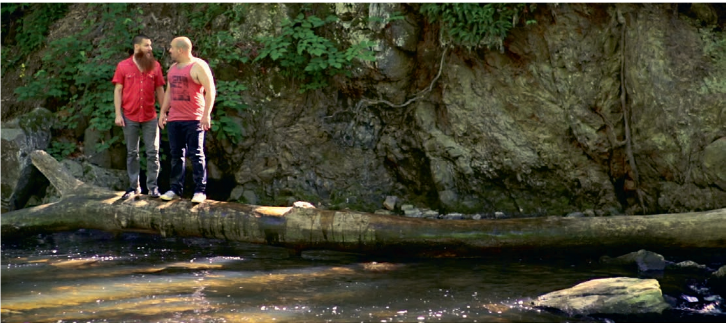
© Nature Theater of Oklahoma États-Unis, Life and Times – episode 8

7:00 pm / 120 min. In English with English subtitles