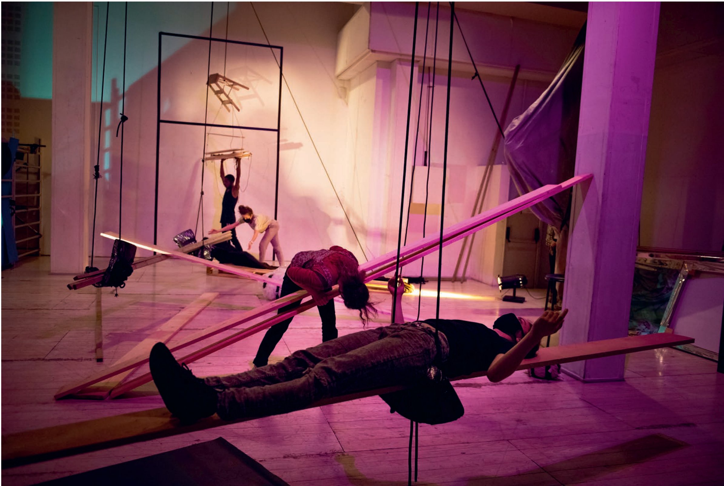
Exerce Montpellier © Siam Coudrais