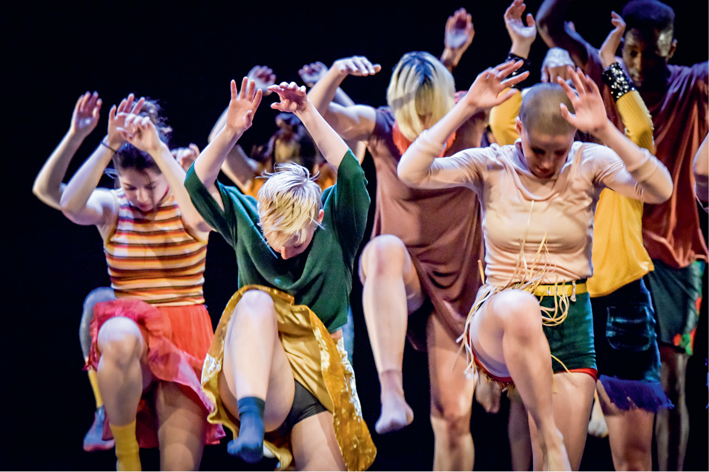
camping / Summer 2019