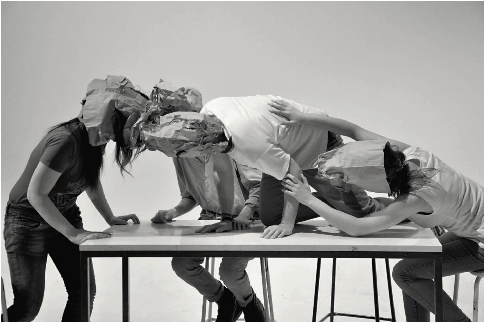
École Nationale Supérieure d’Arts de Paris-Cergy © Zoé Pautet