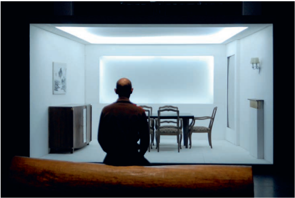
Vincent Dupont, Hauts Cris (miniature)

Repertoire Vincent Dupont France Hauts Cris (miniature) 06.25 > 27 9:00 pm / 45 min. At Laboratoires d'Aubervilliers € 15 / € 10 / € 5 with Laboratoires d'Aubervilliers