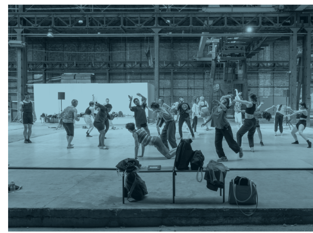
Camping Workshop 2022, Grandes serres in Pantin