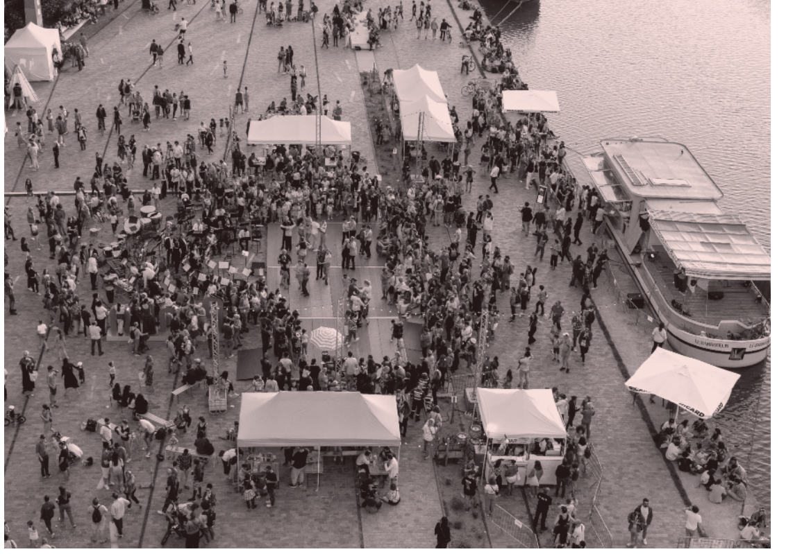
1 km de danse 2022, Canal de l'Ourcq in Pantin

1880 spectators for our performances and special events