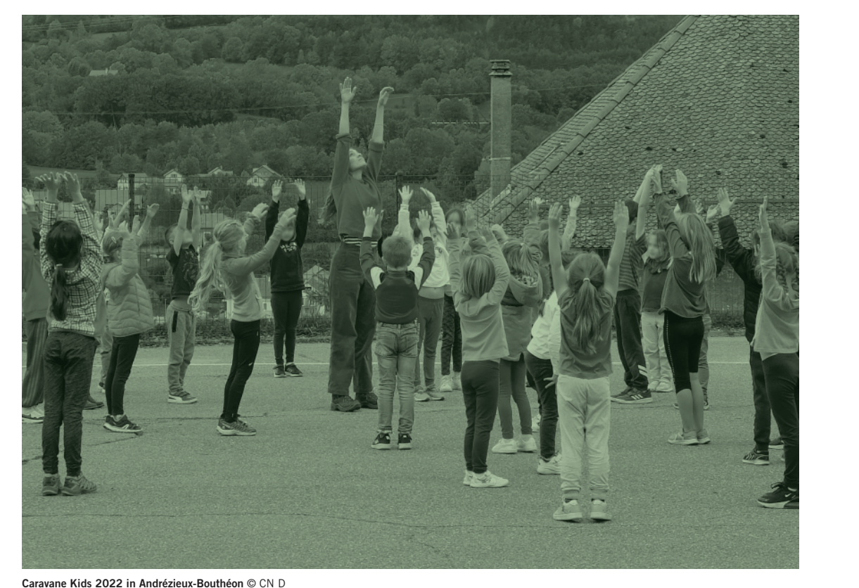
Caravane Kids 2022 in Andrezieux-Boutneon